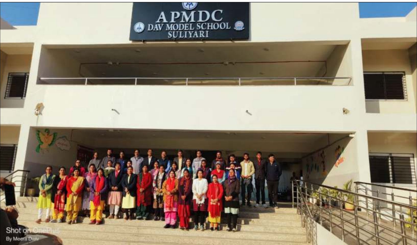
Shot on OnePlus By Meera Dixit